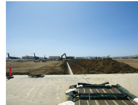
Storm drain installation of concrete in front of paver; End product of 17.5 inch thick paving.

The on-site concrete batch plant and paving machines were able to produce, deliver, and place approx. 250 cubic yards per hour.